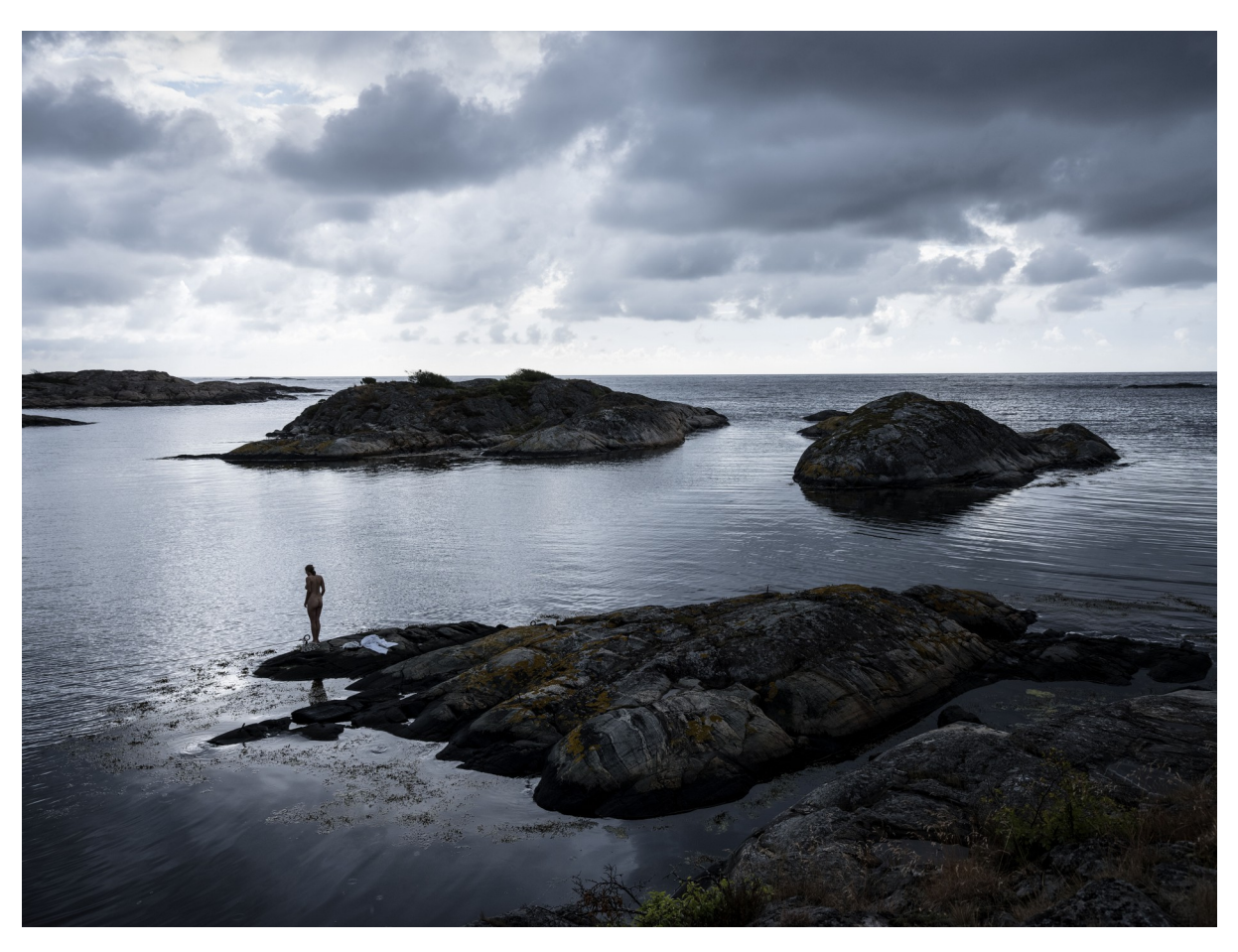
NORWAY. 2017. Risør. Anna's morning swim.

Press photos are available in print resolution (300 dpi) and web resolution (72 dpi). Please note that the press photos are neither edited nor may be croped. The credits/image signatures are below the photos.