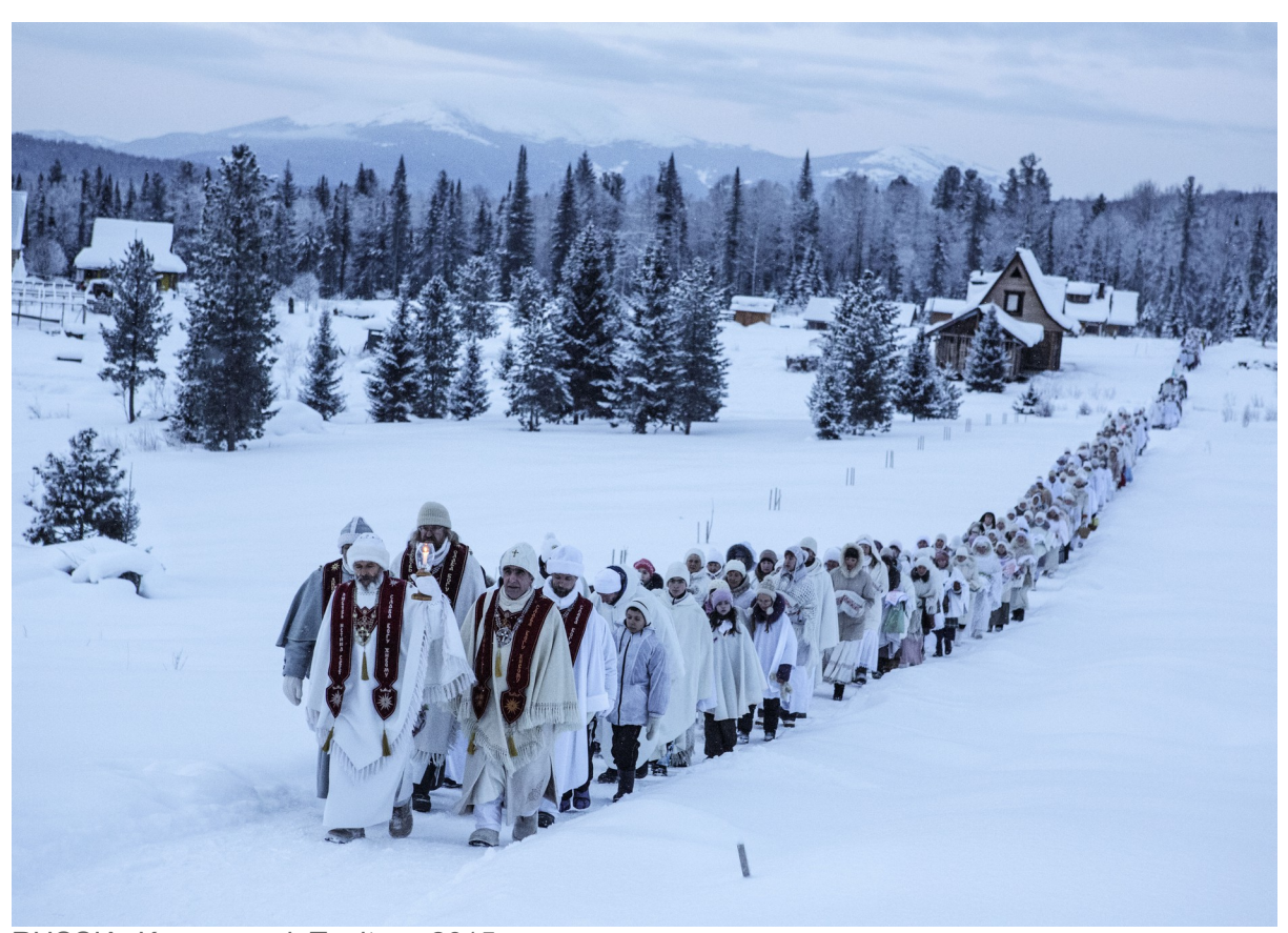
RUSSIA. Krasnoyarsk Territory. 2015. Followers of Vissarion arrive in the innermost Vissarionite village of Obitel Rassveta during a Christmas pilgrimage.